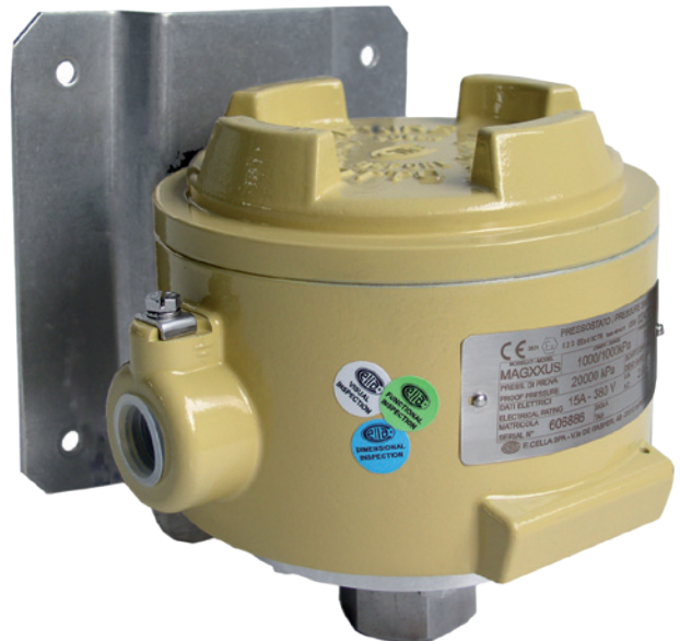
Pressure switch with diaphragm piston model MAH